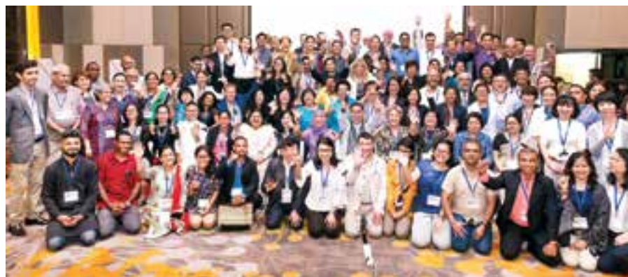
ASPBAE’s core strategic partnership is with its members located in 33 countries in the Asia South Pacific.

ASPBAE continues to play leadership roles in global civil society networks advancing the right to education and lifelong