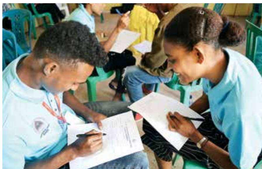
ASPBAE will seek to sustain its ongoing work that brings together ALE practitioners and advocates in programme initiatives related to capacity building.

The Training for Transformation (TfT) Program of ASPBAE has been the core programmatic expression of this strategy, advancing innovative, pro-poor, rights-based adult education through the targeted activities.