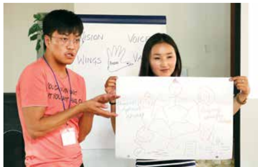
ASPBAE has been able to create an environment for nurturing the potential of the youth, enabling youth leaders to have a voice and agency within member organisations and in decision-making processes.

For 2021-2024, ASPBAE's youth engagement strategy will focus on enabling a critical mass of young people, within the youth constituencies of members, to demand their right to education and pursue the SDG 4 agenda in education policy spaces and other decision-making bodies in local, national, regional, and international platforms.