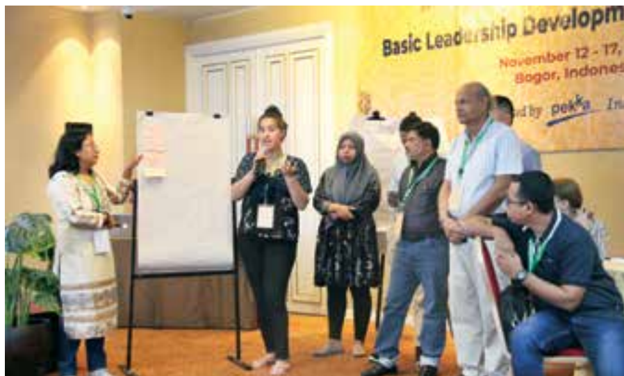
ASPBAE's Basic Leadership Development Course (BLDC) was one of its major arenas for capacity building directed at ALE practitioners in dialogue with ALE advocates.

ASPBAE will seek to sustain its ongoing work that brings together ALE practitioners and advocates in programme initiatives related to capacity building, such as the work on SDG 4.7, and on skills education for decent work of marginalised women. It will continue to be poised to respond to on-demand training/capacity-building invitations from members and partners, mobilising the deep bench of expertise within the network on ALE practice and ALE.