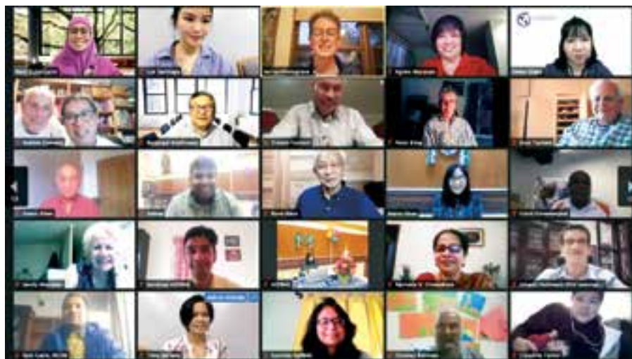
The 8th ASPBAE General Assembly culminated in a regional strategic planning workshop held virtually due to the pandemic.

sub-regional cluster meetings and national consultations. In June 2020, three sub-regional cluster meetings were organised in: (1) South Asia, East Asia and South East Asia; (2) South Pacific, and; (3) Central Asia, where member organisations from 26 countries participated. The main agenda of the cluster meetings was to offer an in-depth briefing to the accredited members on the areas for discussion during country consultations. Milestones of ASPBAE's work in the period 2017-2020 were presented