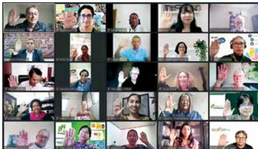
ASPBAE continues to play leadership roles in global civil society networks advancing the right to education and lifelong learning.

Over the years ASPBAE has built strong strategic partnerships with other civil society organisations, intergovernmental organisations and institutes, recognising that the achievement of its goals and strategic objectives is best served by strongly working in tandem and in partnership and solidarity with other similarly-motivated groups.