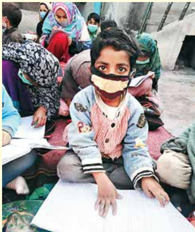
ASPBAE's Regional Strategic Planning Workshop in December 2020 called upon the membership to see how it can continue to be responsive to the impacts of COVID-19 and developmental challenges.

Apart from responding to current and emerging contextual issues, ASPBAE's strategic plan for 2021-2024 also draws on the main messages and recommendations of its members during its 8th GA-related consultations with its members that will define its work in the next four years. Building on these national consultations, sub-regional cluster meetings, thematic working group discussions, and youth consultations, the following are the highlights of how these will be reflected in ASPBAE's strategic directions.