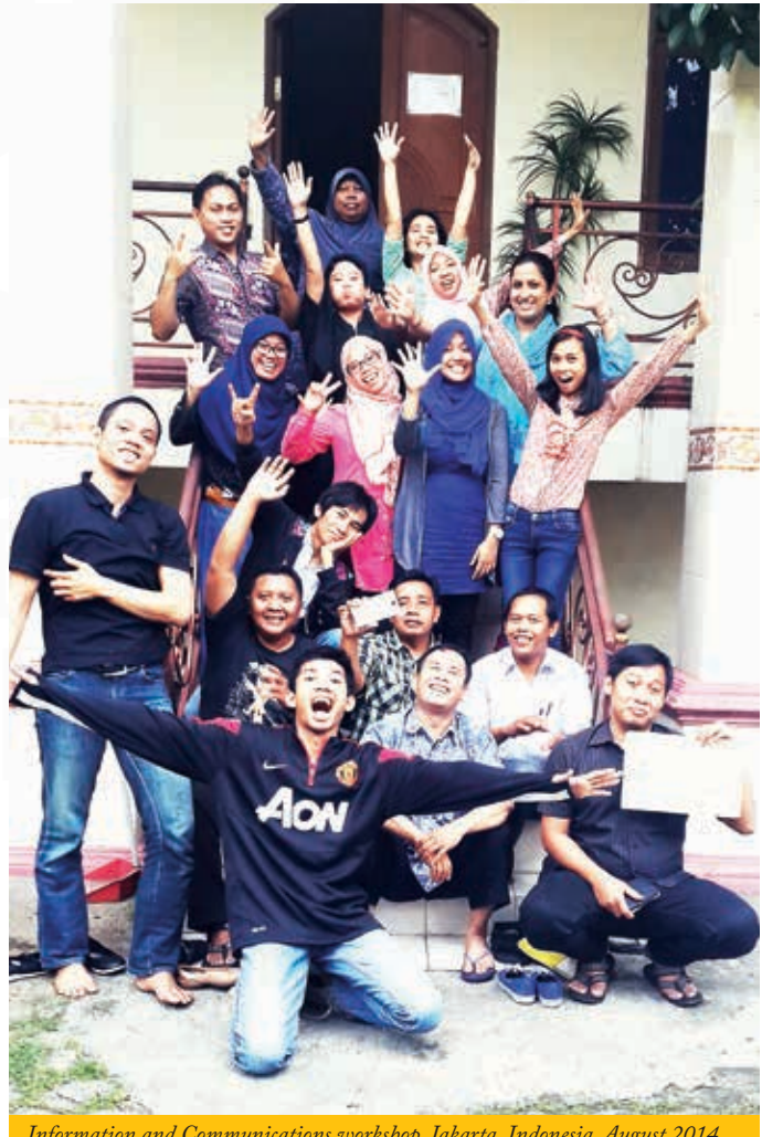
Information and Communications workshop, Jakarta, Indonesia, August 2014.

two workshops on Information and Communications work were organised by ASPBAE's Information and Communications Coordinator with NCE Nepal (29-30 March) and with NEW Indonesia (18-19 August).