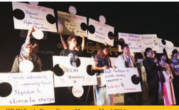
ASEAN Peoples Forum, Yangon, Myanmar, March 2014.