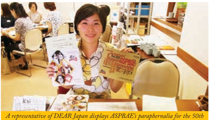
A representative of DEAR Japan displays ASPBAE's paraphernalia for the 50th anniversary. Photo taken during the national consultation in Japan, 2014.

ASPBAE FESTIVAL OF LEARNING: The Festival of Learning (FoL), convened from 18-21 November 2014 in Yogyakarta, Indonesia, was a fitting culmination of the year-long activities and ASPBAE's 50 year journey. With the theme, 'Asia Pacific Civil Society, Defining Education for the Future', the Festival of Learning was successful in its ambitious attempt to creatively (1) offer a space to strategise Asia Pacific civil society's coordinated action for the World Education Forum 2015 in Korea and, indeed, in ensuring education's worthy space in the new development agenda post 2015; (2) provide a platform to deliberate on the overall context and policy climate that define education and lifelong learning work in the region - especially as they interact and respond to the outstanding challenges of poverty, massive unemployment, inequity, and continuing disparities, conflict, climate change, privatisation of education, to name some; (3) provide an arena to showcase the rich work of ASPBAE and its members