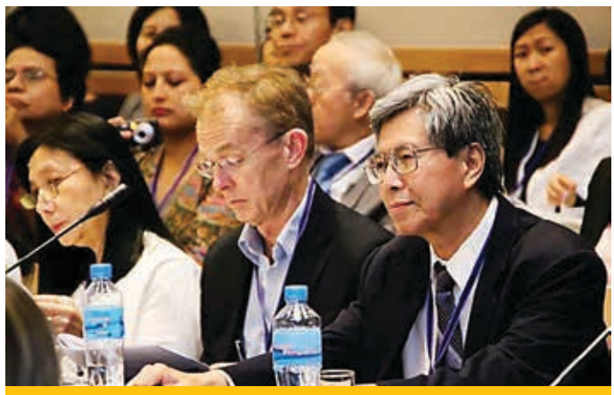
ASPBAE, along with partner civil society organisations, was able to lobby agreements in APREC to support the Muscat Agreement, but with bolder and more ambitious targets for the Asia Pacific.

especially attentive to the learning needs and contexts of marginalised groups.