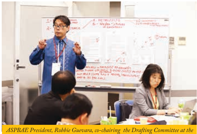
Kominkan-CLC International on ESD in Okayama, Japan, October 2014.

Conference on Higher Education for Sustainable Development: Higher Education Beyond 2014 on 9 November in Nagoya, one of the preparatory events to the ESD Conference.