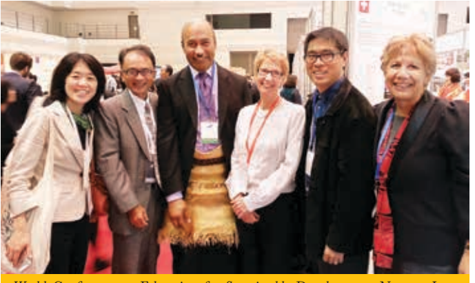
World Conference on Education for Sustainable Development, Nagoya, Japan, November 2014.